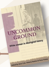
Uncommon Ground — May