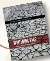
Whitening Race — November