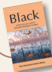
Thinking Black — August