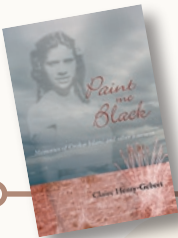
Paint Me Black — April