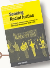
Seeking Racial Justice — November