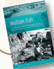
Mutton Fish — April