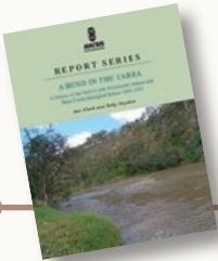
A Bend in the Yarra — November