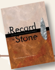
A Record in Stone — August