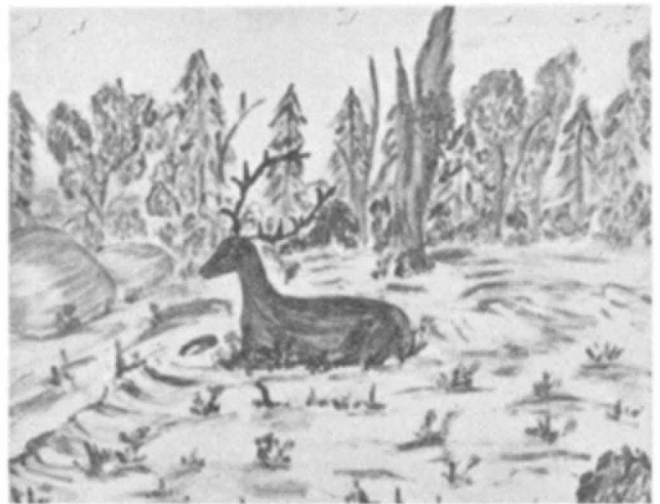
A Fine Black and White Sketch by Rita Wenberg