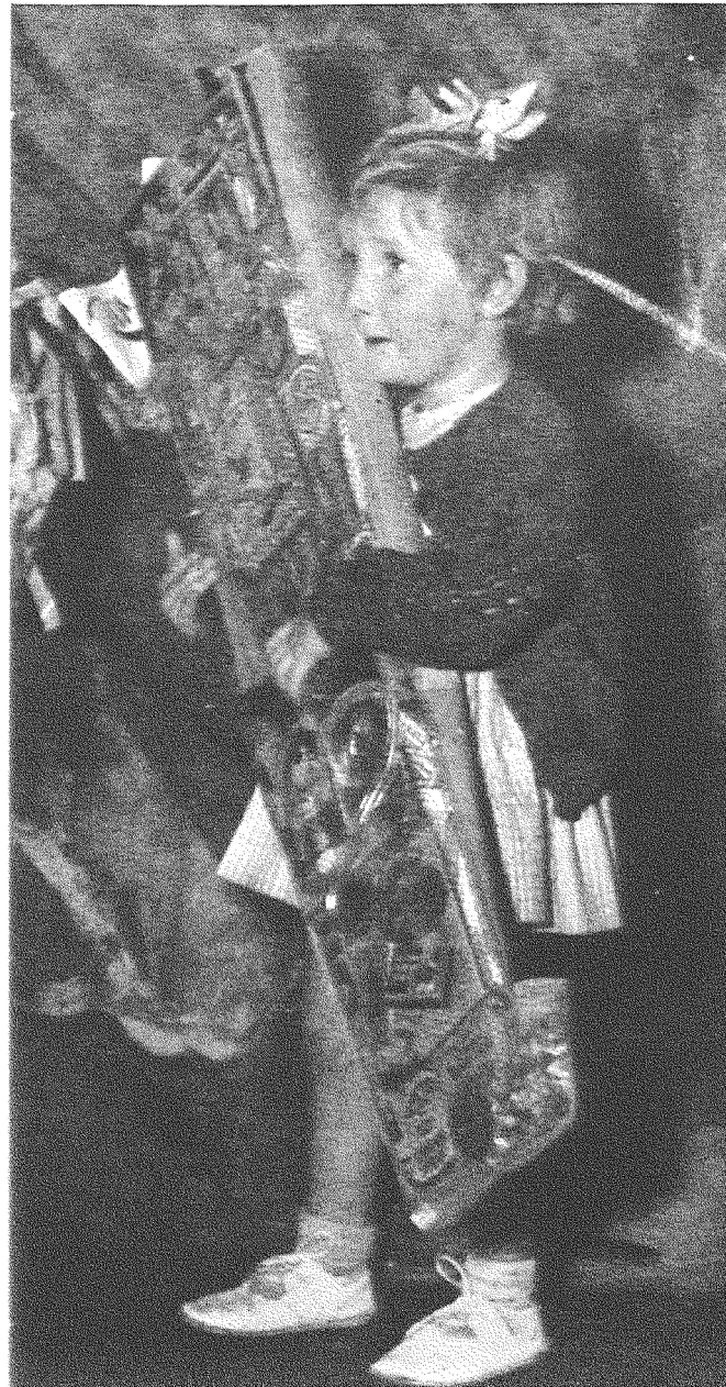
Wow! Just look at that stocking.

Due to a terrific amount of hard work by all concerned, the Tabulam school beautification scheme has been completed and is already beginning to bear fruit. Firstly, the front of the school has been terraced and concrete retaining walls erected. This work was all done voluntarily by the teacher and station residents.