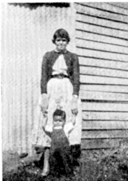
We'd like to introduce you to these two folk from Guyra but unfortunately we don't know their names.