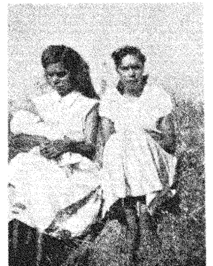
These two young ladies took advantage of a nice sunny day to take baby for a walk.